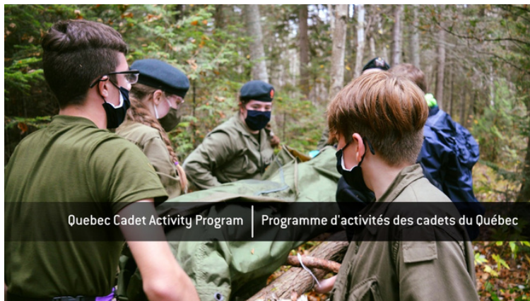
Quebec Cadet Activity Program | Programme d'activités des cadets du Québec

Welcome to the Cadet Activity Programs! Throughout your participation, you will be challenged in a variety of activities. Be sure to review these rallying instructions with your parents/guardians so that you are prepared for each day of your CAP!