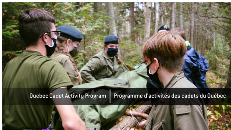
Quebec Cadet Activity Program | Programme d'activités des cadets du Québec

Welcome to the Cadet Activity Programs! Throughout your participation, you will be challenged in a variety of activities. Be sure to review these rallying instructions with your parents/guardians so that you are prepared for each day of your CAP!